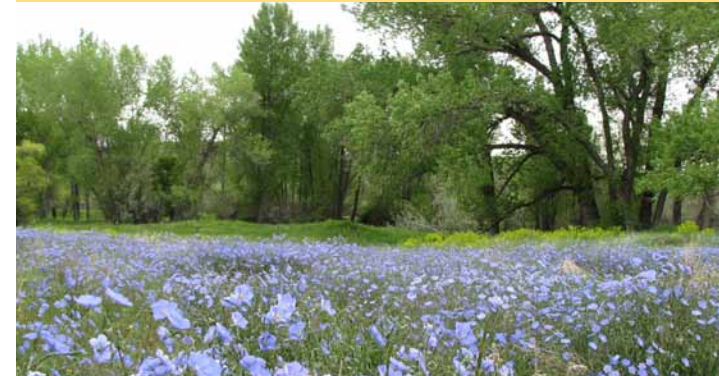
The Foundation has supported the creation of a public park at a historic ranch.