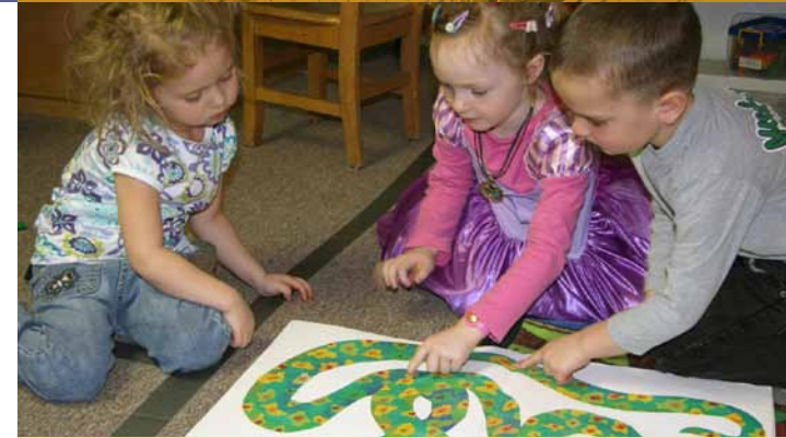
The Foundation has invested in an early literacy program for preschool children.

This is just a sample of the projects that benefit from the Foundation's support. These projects touch people from all age groups and all walks of life.