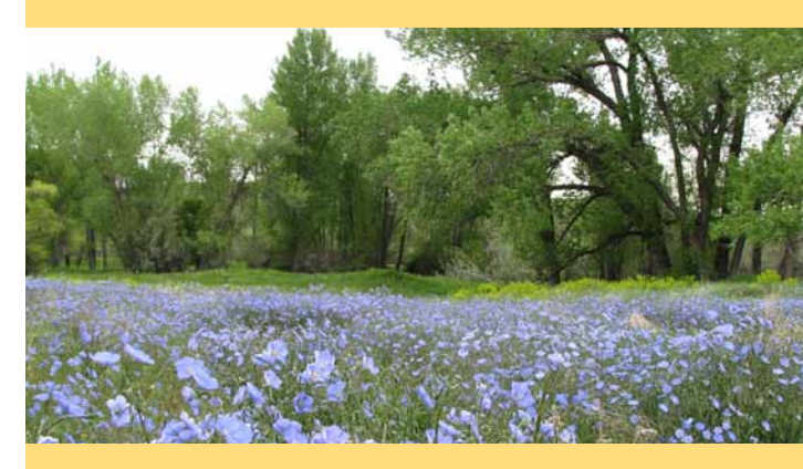
The Foundation has supported the creation of a public park at a historic ranch.