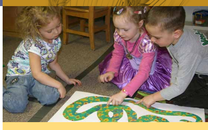
The Foundation has invested in an early literacy program for preschool children.

This is just a sample of the projects that benefit from the Foundation's support. These projects touch people from all age groups and all walks of life.